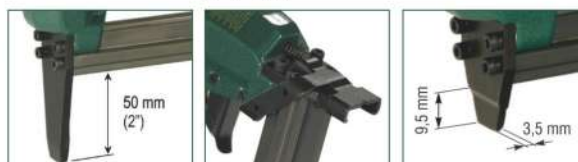
Versione SL - SL model