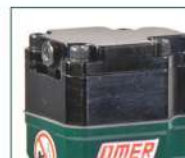
Versione V - V model