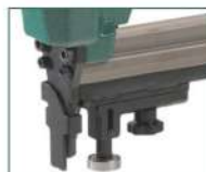
Versione D - D model