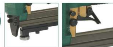
Versione D - D model